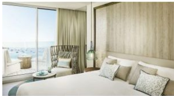
Deluxe Sea View Room