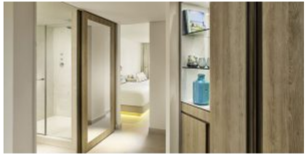
Deluxe Sea View Room Bathroom