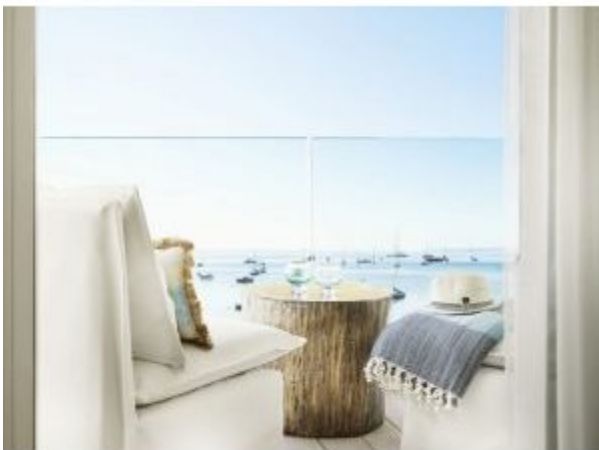
Deluxe Sea View Terrace

Pool Bar: sea views and a relaxed poolside setting make the Pool Bar the ideal spot to spend the day. Guests can order from the bar or enjoy waiter service, The Pool Bar offers an extensive menu, which means visitors can snack on fresh sushi rolls and fruit platters without ever leaving their sun lounge